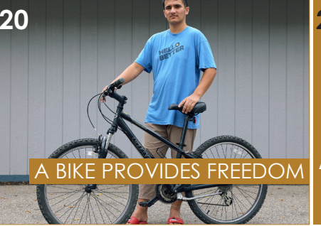
A BIKE PROVIDES FREEDOM

19 amazon VISIT UPCYCLE BIKES AMAZON WISHLIST AND CONSIDER A DONATION.