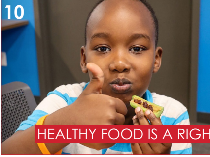
HEALTHY FOOD IS A RIGHT

9 STUDENTS TASTE TESTED KFB SACK SUPPER ITEMS. THEIR FAVORITES WERE PRETZELS W/ SUNBUTTER AND YOGURT W/ GRANOLA. .... WHAT'S YOUR FAVORITE HEALTHY SNACK?