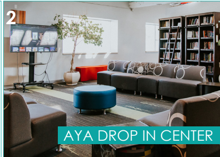
AYA DROP IN CENTER

1 Come IN THE Midst of... DESPAIR AND BRING HOPE