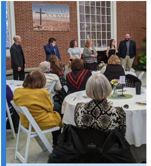
Women's City Club monthly meeting