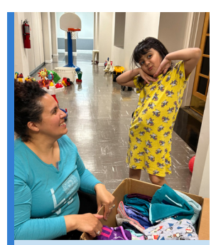
Family Promise IHN guests