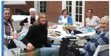
Needlepoint and other social groups bring us together in fellowship.