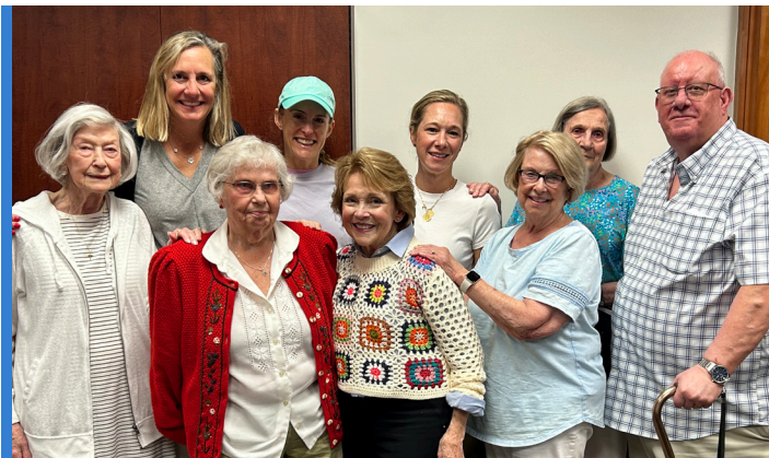
Committees: Mayflower relies on its members to faithfully serve in volunteer roles on church council and committees.