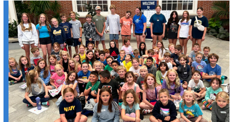
Art Camp: Mayflower offers art camp to K-5 th students during the summer.