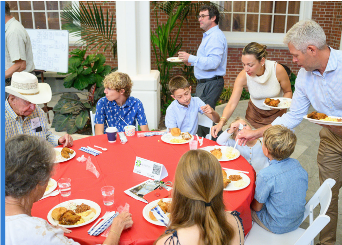
Annual Church Picnic: Every fall we host a picnic for all of our congregants, offering intergenerational fellowship.

In the future we hope to: offer a youth mission experience, organize additional interest groups and intergenerational events, hire additional needed staff.