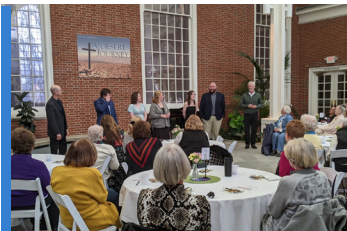
Women's City Club meets regularly in the Atrium