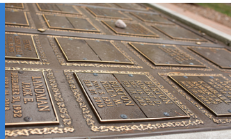
The Columbarium is located in the garden on the south side of the church