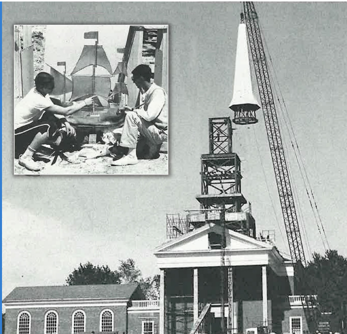
June 1961 - The 43 foot steeple was lifted into place with the replica of the Mayflower ship weathervane.