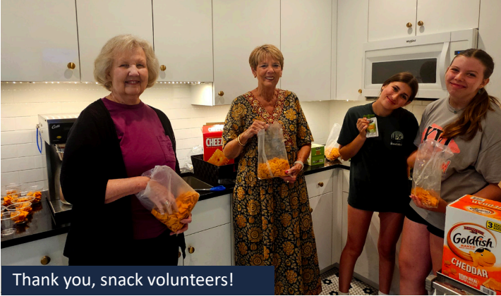
Thank you, snack volunteers!