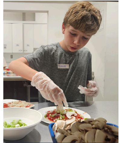
The art of cooking