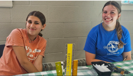
Thank you, Middle School Leaders!