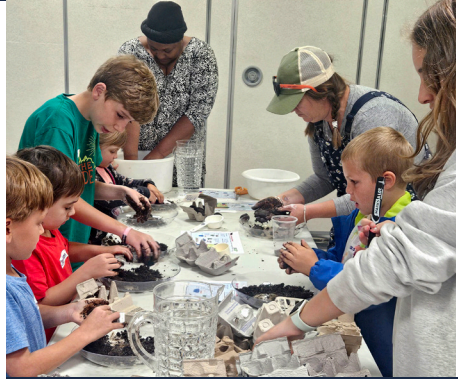
Gardening with New City Neighbors