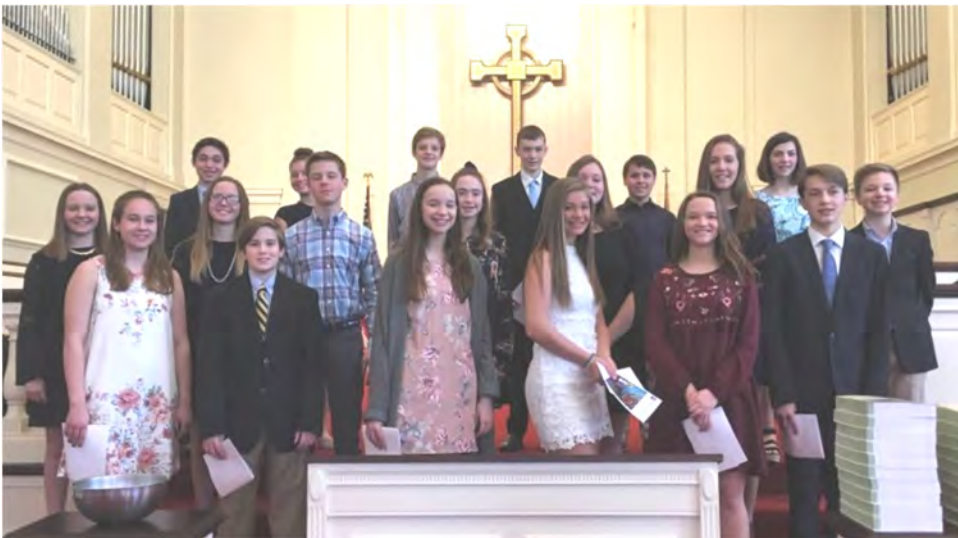
Confirmation Class of 2018